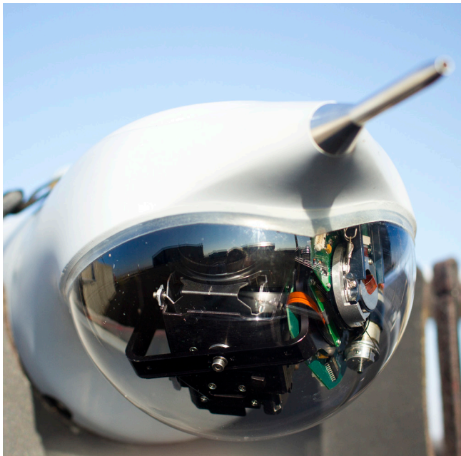
ScanEagle® is a product of Insitu Inc.